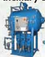
Deaerators, Feedwater Systems, & Blowdown Separators