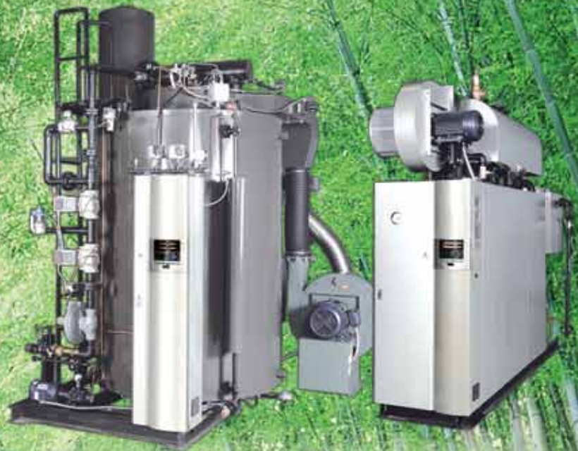
MIURA Gas or Oil Fired EX Series High Pressure Steam Boiler