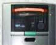
Yellow (warning) Red (emergency)